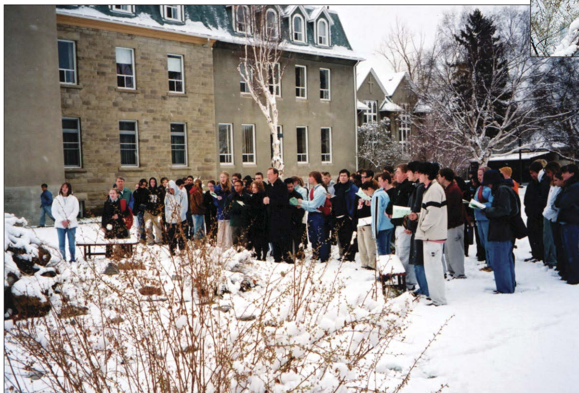
The freshly falling snow did little to dampen the singing that accompanied our pilgrimage.