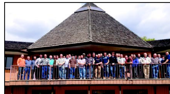
CACHE CREEK, MAY 1-2. ‘The Average Joe’s Guide to Prayer’ retreat at IHM Shrine also offered outdoor activities. Read all about it on PAGE 11.