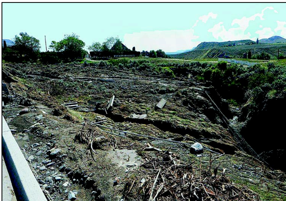
STAGE ROAD, CACHE CREEK – MAY, 2015. ABOVE Immaculate Heart of Mary (IHM) Shrine’s distinctive peaked roofline is recognizable, but the landscape isn’t. BELOW While the Diocesan Shrine and Centre remained high and dry during the brief but devastating evening storm on May 24, flash flooding took down this fence and tore through the fire hall at the bottom of the hill. A state of emergency was declared because of severe damage in other parts of the community at the junction of the east-west Trans-Canada Highway and north-south Hwy. 97.

PM 4001 3998 RETURN UNDELIVERABLE CANADIAN ADDRESSES TO: The Diocesan News c/o 635A Tranquille Road, Kamloops, BC, V2B 3H5