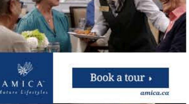
Book a tour + AMICA