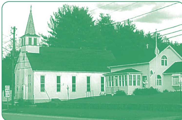
SAINTS THOMAS AND ANNE ROMAN CATHOLIC CHURCH 61 Preston City Road, Voluntown

The Pastoral Council meets on the first Monday of the month at 7:00 p.m.