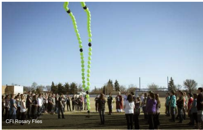
CFI Rosary Flies