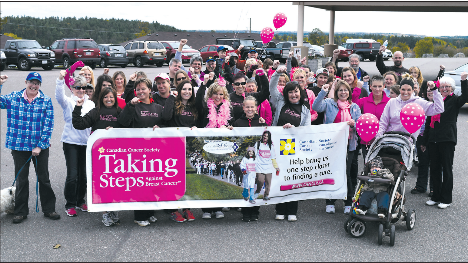
Annual breast cancer walk