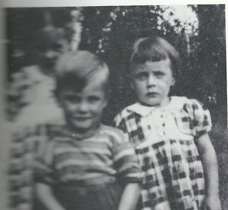
1962 - Check out them pants!