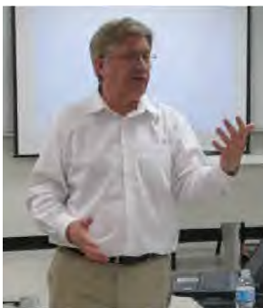
Martin: Resilience in dealing with ageing parents