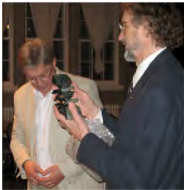
A thoughtful, generous and beautiful gift