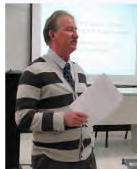
Tom: Spiritual care giver's guide