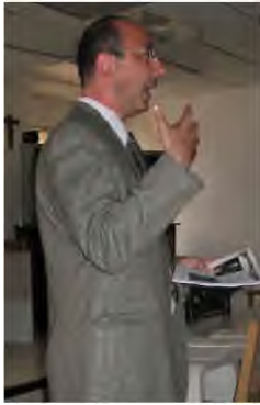
Desmond: Culturally Sensitive assessments & immigrants