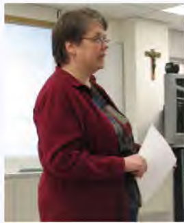
Christine: When students are like corn