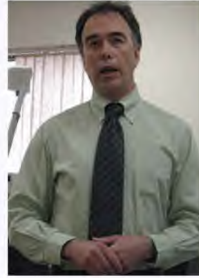
Philip: Parents attachment styles, distress and loss