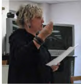
Karljin: Influence of God images in healing