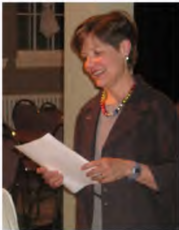
Carrie delivers the Presidential Address