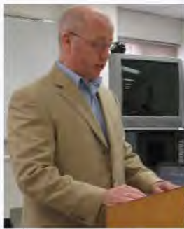
Rene: Grieving process of hetero/homosexual men