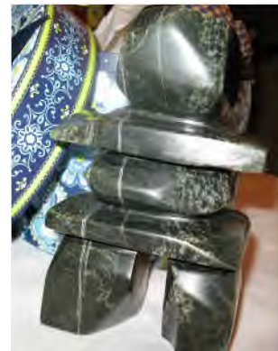
Carving of Inuksuk by Isaac Oqutaq